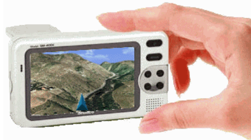
3DVU on PND

( http://www.3dvu.com/images/initial.gif )